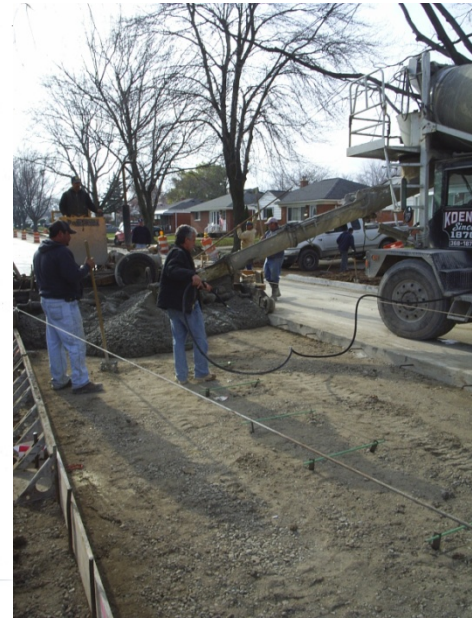
Grant Street Local Paving