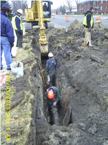
9 Mile Water Main Project Project Water Main Installation